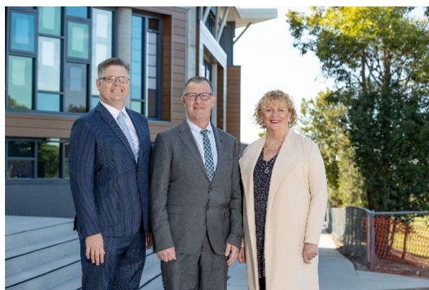
© Brisbane Catholic Education, St Francis College (2021)