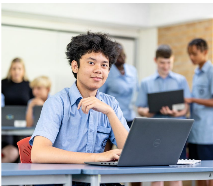
© Brisbane Catholic Education, St Francis College (2024)

This information was correct at the time of printing, but changes in requirements could occur over a three-year period in response to changes in the Australian Curriculum. Similarly, the senior subjects listed here may also change, including subject availability due to class numbers.