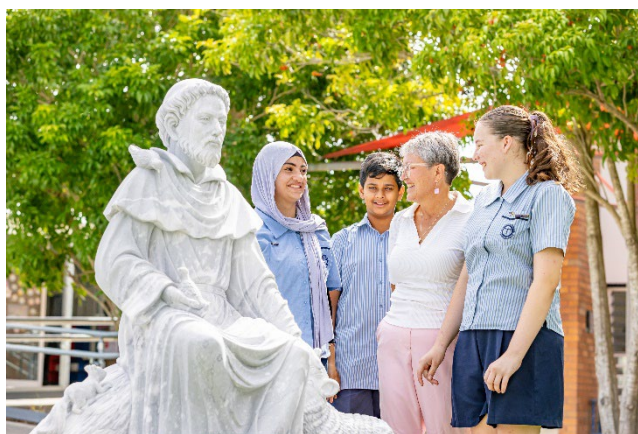
© Brisbane Catholic Education, St Francis College (2024)

Reflect – to provide structured and guided opportunities that promote and enable the development of reflective, self-evaluating individuals. Embed a process of informed, regular, personal, and collaborative review and evaluation of current programmes, strategies and practices that incorporates a celebration of achievements.