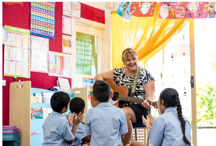
© Brisbane Catholic Education, St Francis College (2024)

A full version of the " Code of Conduct for Volunteers and Other Personnel " is available on the College website.