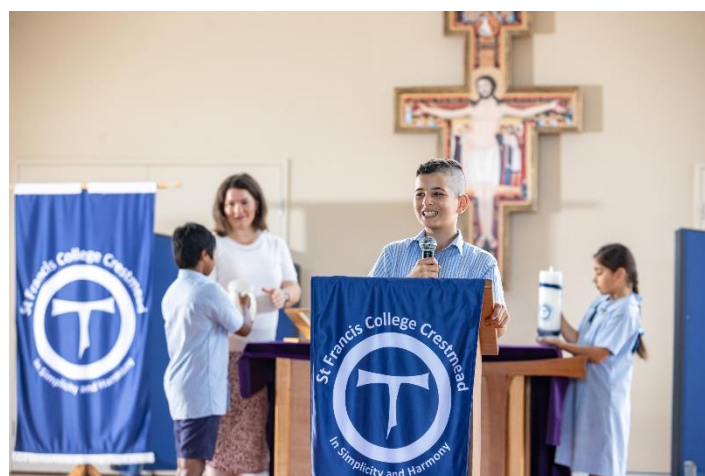
© Brisbane Catholic Education, St Francis College (2024)

Parent Slips – Parent/Caregiver permission for excursions. Please note that all details of excursions upon approval of the Parent Slip.