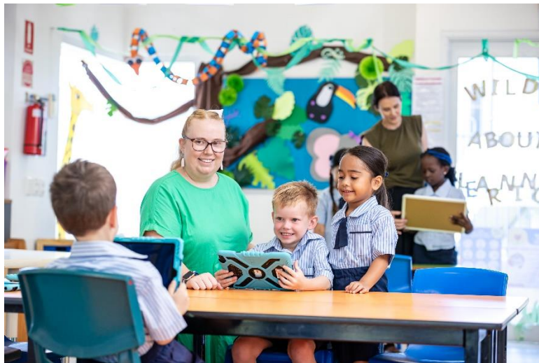
© Brisbane Catholic Education, St Francis College (2024)

A full guide to “Fees and Levies 2025” and an “Application for Concession on Fees” form are available on the Parent Portal or the College Finance Office.