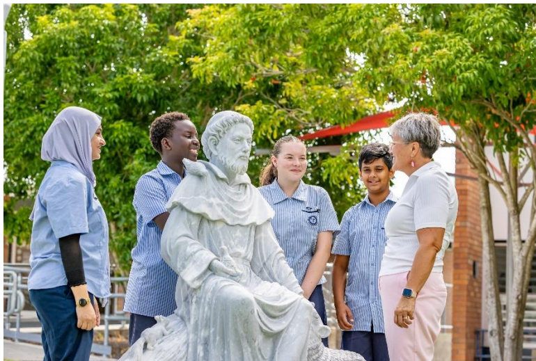
© Brisbane Catholic Education, St Francis College (2024)

A full copy of “Safe School Statement” is available on the Parent Portal or from the College office.